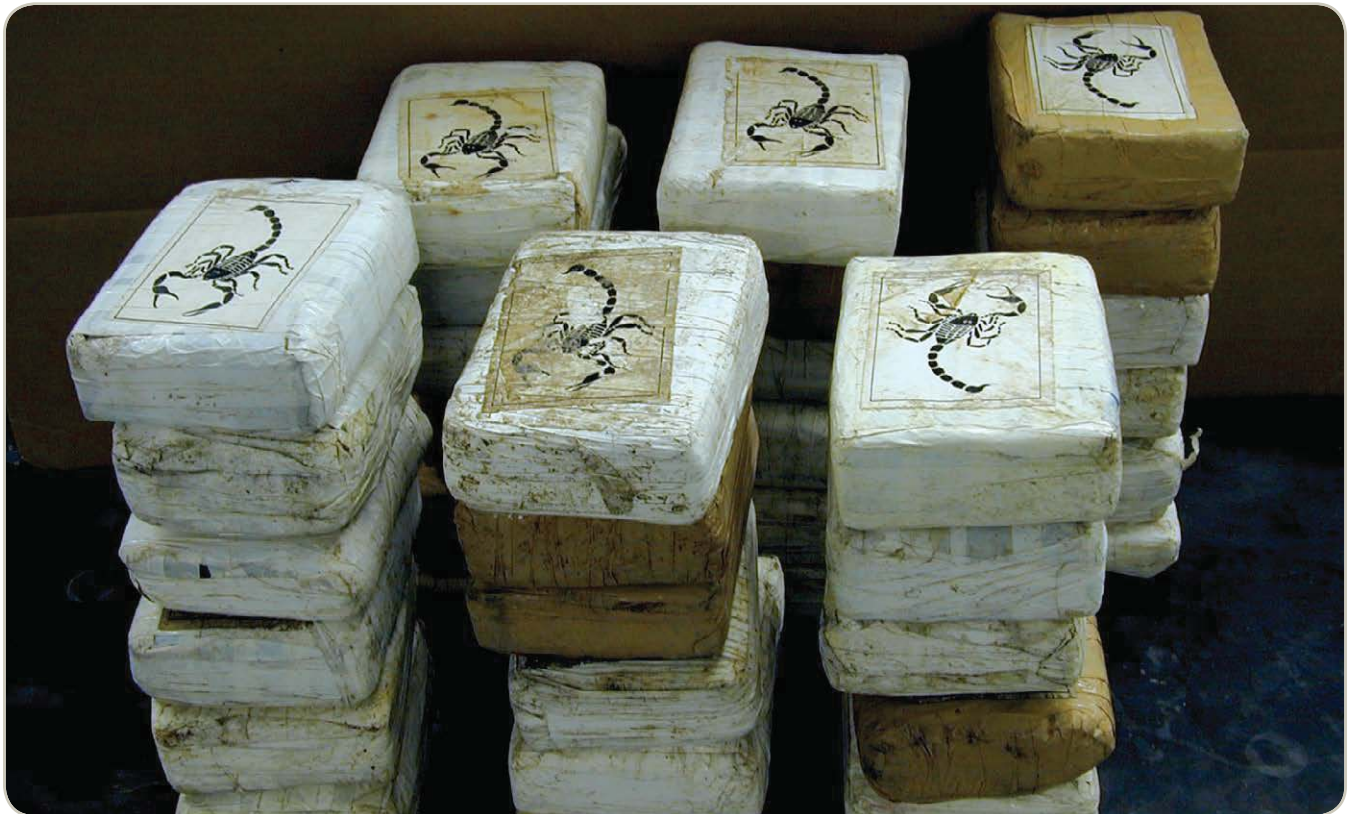
Cocaine bricks, seized by DEA

Cocaine is a Schedule II drug under the Controlled Substances Act, meaning it has a high potential for abuse and has an accepted medical use for treatment in the United States. Cocaine hydrochloride solution (4 percent and 10 percent) is used primarily as a topical local anesthetic for the upper respiratory tract. It also is used to reduce bleeding of the mucous membranes in the mouth, throat, and nasal cavities. However, better products have been developed for these purposes, and cocaine is rarely used medically in the United States.