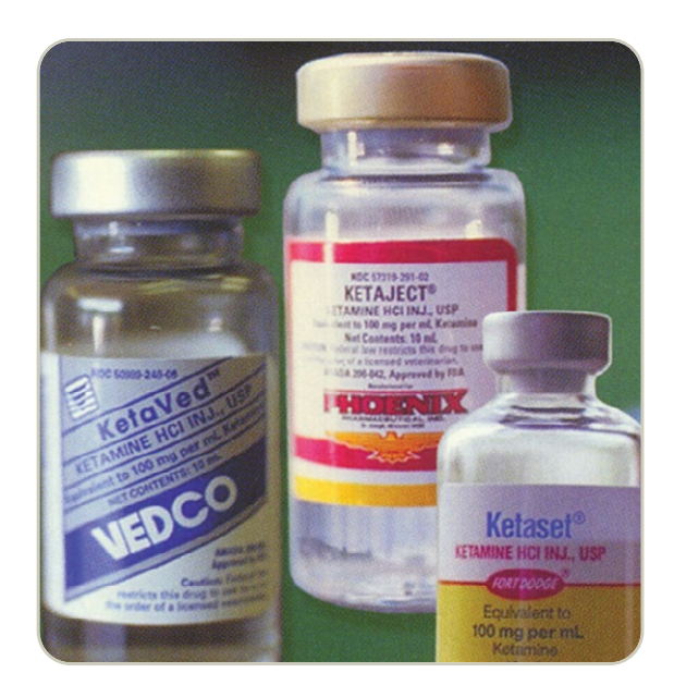
Vials containing liquid ketamine

Ketamine, along with the other "club drugs," has become popular among teens and young adults at dance clubs, musical festivals, and concerts. Ketamine is manufactured commercially as a powder