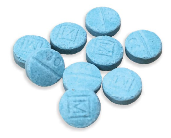
Clandestinely produced fake oxycodone tablets that contain fentanyl.

Abuse of clandestinely produced synthetic opioids parallels that of heroin and prescription opioid analgesics. Many of these illicitly produced synthetic opioids are more potent than morphine and heroin and thus have the potential to result in a fatal overdose.