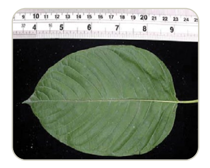
Leaf of kratom tree