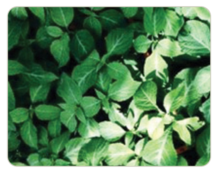
Leaves of the Salvia divinorum plant

The plant has spade-shaped variegated green leaves that look similar to mint. The plants themselves grow to more than three feet high, have large green leaves, hollow square stems, and white flowers with purple calyces.