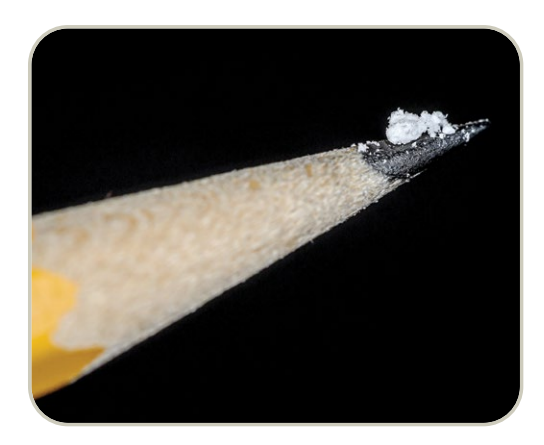
A lethal dose of fentanyl

According to the Centers for Disease Control and Prevention (CDC), overdose deaths involving synthetic opioids, excluding methadone were involved in roughly 2,600 drug overdose deaths each year in 2011 and 2012, but from 2013 through 2021, the number of drug overdose deaths involving synthetic opioids, excluding methadone increased dramatically each year, to more than 68,000 in 2021. The total number of overdose deaths for this category was greater than 258,000 for 2013 through 2021. These overdose deaths involving synthetic opioids is primarily driven by illicitly manufactured fentanyl, including fentanyl analogs. Consistent with overdose death data, the trafficking, distribution, and abuse of illicitly produced fentanyl and fentanyl analogs positively correlates with the associated dramatic increase in overdose fatalities.