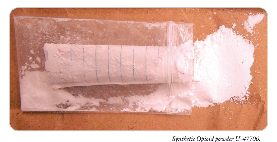
y 1 1