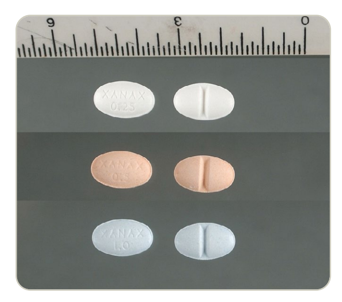
Xanax 0.25,0.5 and 1mg scored tablets

Generally, legitimate pharmaceutical products are diverted to the illicit market. Teens and others can obtain depressants from the family medicine cabinet, friends, family members, the Internet, doctors, and hospitals.