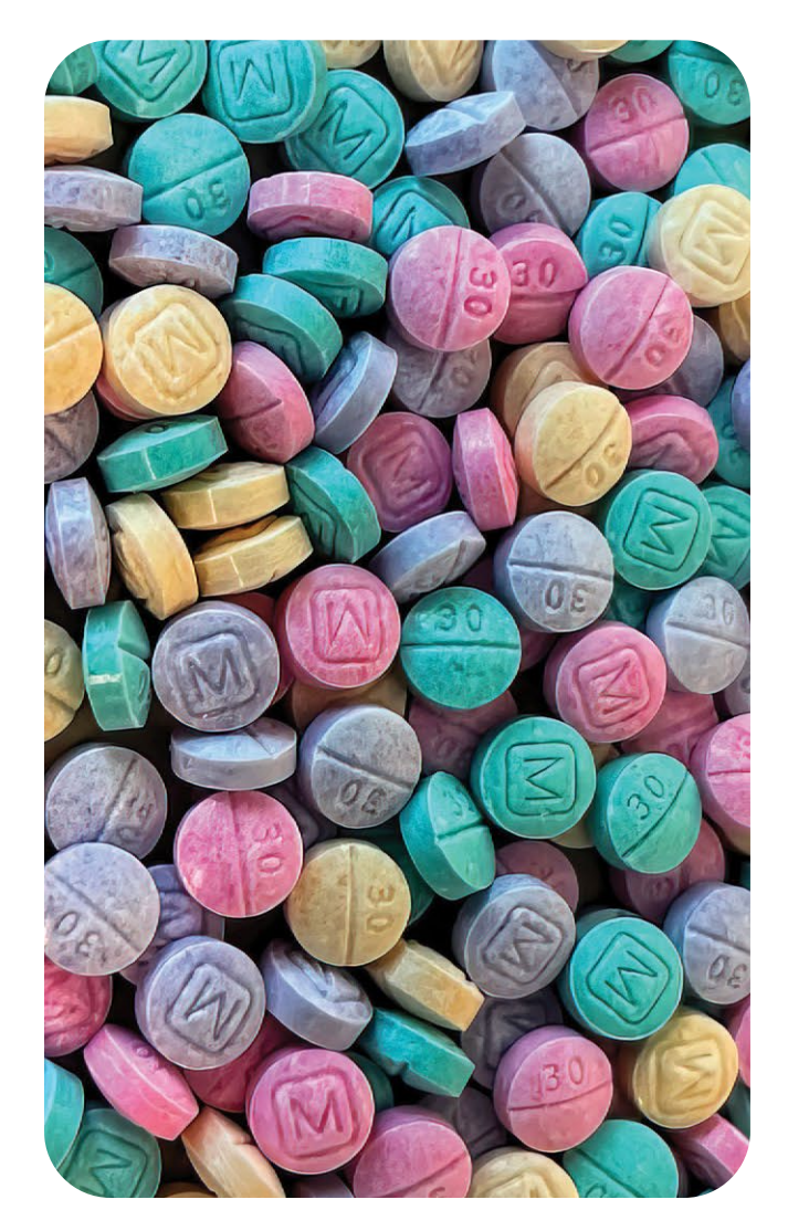
Fake rainbow oxycodone M30 tablets containing fentanyl

Fentanyl is a Schedule II narcotic under the United States Controlled Substances Act of 1970.