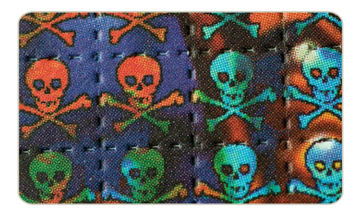
LSD blotter paper

During the first hour after ingestion, users may experience visual changes with extreme changes in mood. While under the influence, the user may suffer impaired depth and time perception accompanied by distorted perception of the shape