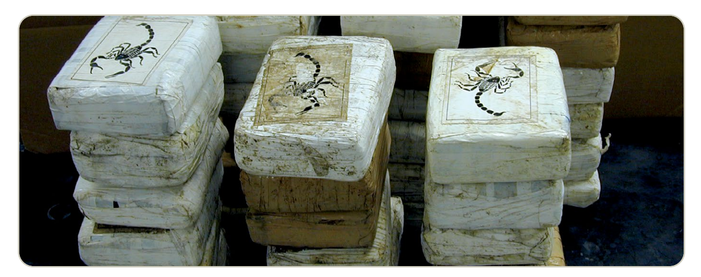
Cocaine bricks, seized by DEA

Cocaine is a Schedule II drug under the Controlled Substances Act, meaning it has a high potential for abuse and has an accepted medical use for treatment in the United States. Cocaine hydrochloride solution (4 percent and 10 percent) is used primarily as a topical local anesthetic for the upper respiratory tract. It also is used to reduce bleeding of the mucous membranes in the mouth, throat, and nasal cavities. However, more effective products have been developed for these purposes, and cocaine is now rarely used medically in the United States.