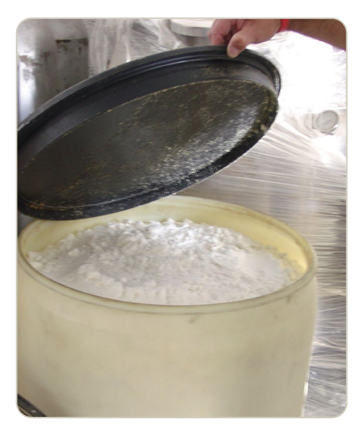
Methamphetamine in finished form

Regular meth is a pill or powder. Crystal meth resembles glass fragments or shiny blue-white "rocks" of various sizes.