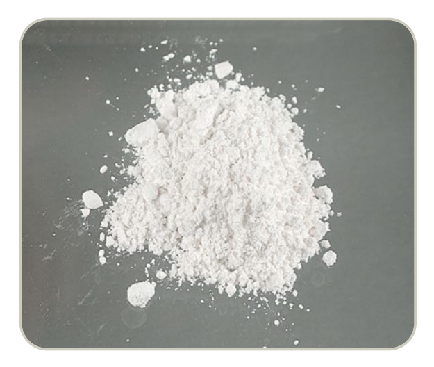
White powder heroin