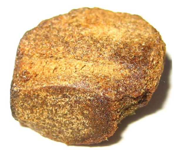
Marijuana concentrate

Many methods are utilized to convert or "manufacture" marijuana into marijuana concentrates. One method is the butane extraction process. This process is particularly dangerous because it uses highly flammable butane to extract the THC from the cannabis plant. Given the flammable nature of butane, this process has